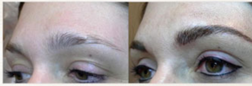
Eyebrow and eyeliner removal